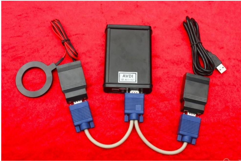
Picture 3 FLY dongle connection to AVDI 2