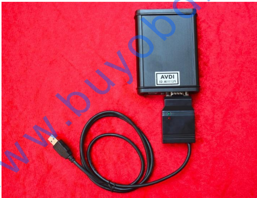
Picture 2 FLY dongle connection to AVDI 1

Picture of FLY dongle and AVDI(without DB15 converter):