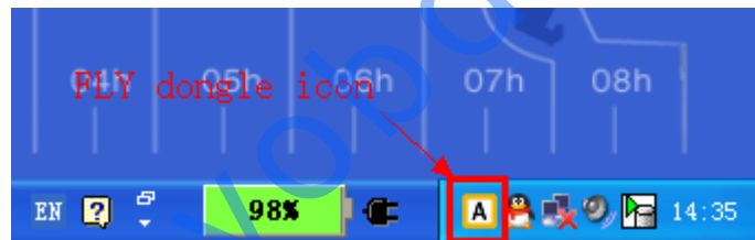
Picture 5 FLY dongle icon

Click vehicle icon, an “FLY dongle” icon appears on right-bottom corner of desktop (tray bar).