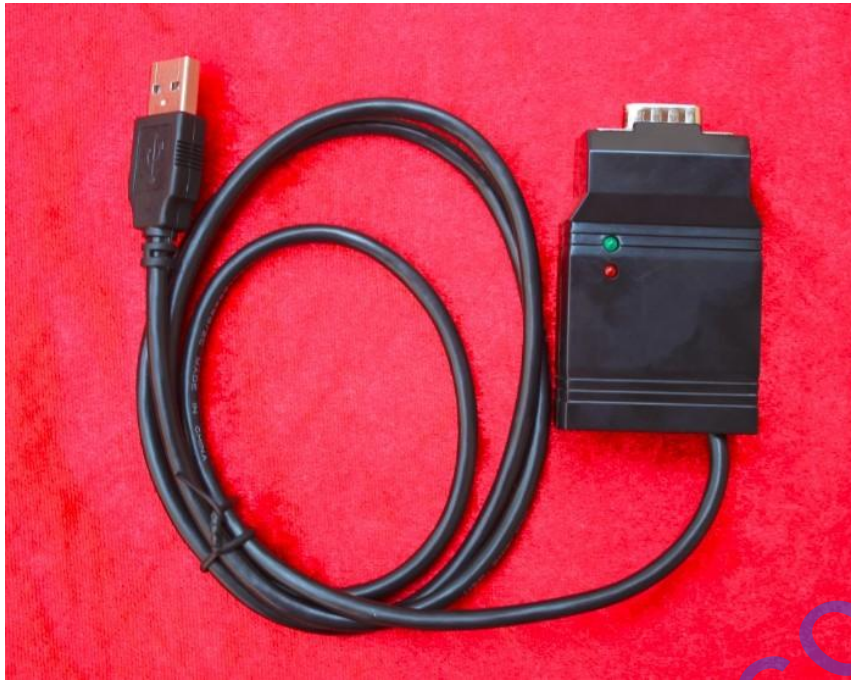
Picture 1 FLY dongle

Picture of FLY dongle and AVDI(without DB15 converter):